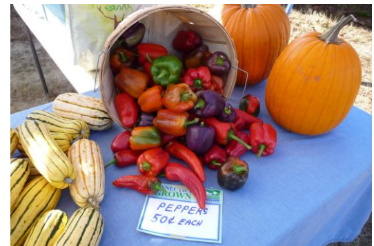
Ashford-grown produce is proudly displayed at the Ashford Farmers Market

The Commission is interested in continuing to promote, support, assist and encourage agriculture now and in the future. To this end we are proud to have a member of National FFA as a member.