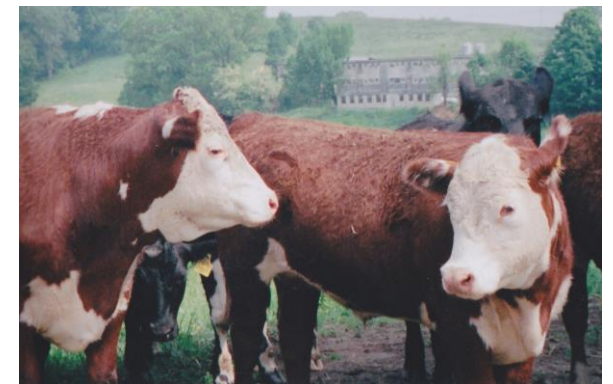
A view of Zaicek farm