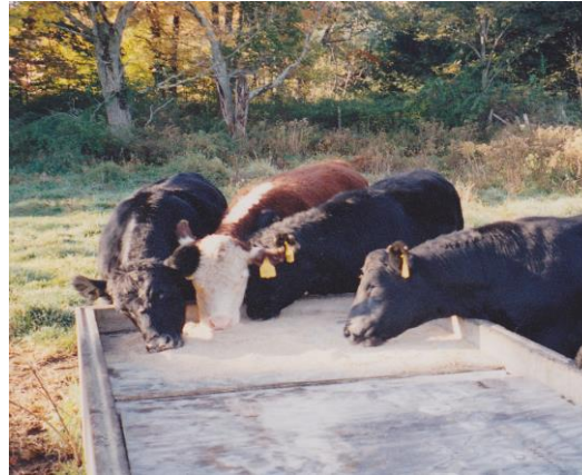
More views of Zaicek Farm